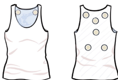
Fig2 .Hot vest on back

according to their own needs. The addition of powder bag solves the situation that the hot paste on the market can not touch the skin and there is no real medical effect, and also improves the inconvenience of replacing the traditional paste.