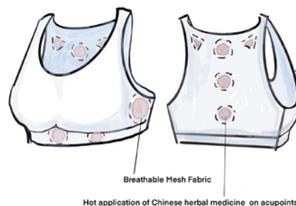
Fig1 .Warm underwear on the chest and back

This design can temporarily and effectively alleviate the existing problems in the market, such as the inconvenience of hot compress and the lack of good combination of hot compress and traditional Chinese medicine. As people increasingly focus on self-preservation, it is crucial to develop a product that combines the two. The form may not be specific to a particular product, but the idea can be expressed. In this study, it is applied to the design of intimate clothing, and developed according to the needs of different parts and different seasons. Its use scope is broad, the use method is simple, in the Chinese herbal medicine package configuration also needs the Chinese medicine scholar in-depth study, the following design to launch a brief introduction.